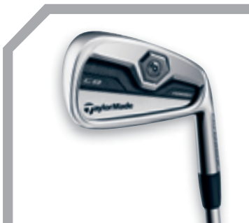
TOUR PREFERRED® CB