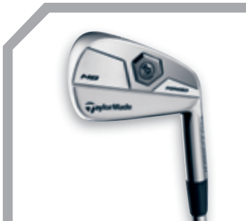
TOUR PREFERRED® MB