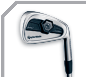
TOUR PREFERRED® MC